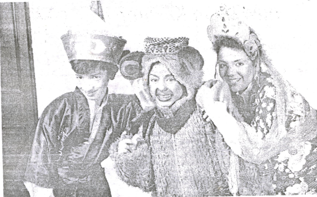
Children at play... a still from Aladdin Xtravaganza

crecendo, with improvisation holding all the punches. Boxy the bulldog barked his way to the rehearsal. Sniffing and snorting, he made his presence felt and kept getting in the way, in a nice way. But sadly, Boxy has no connection whatsoever to the play — he is